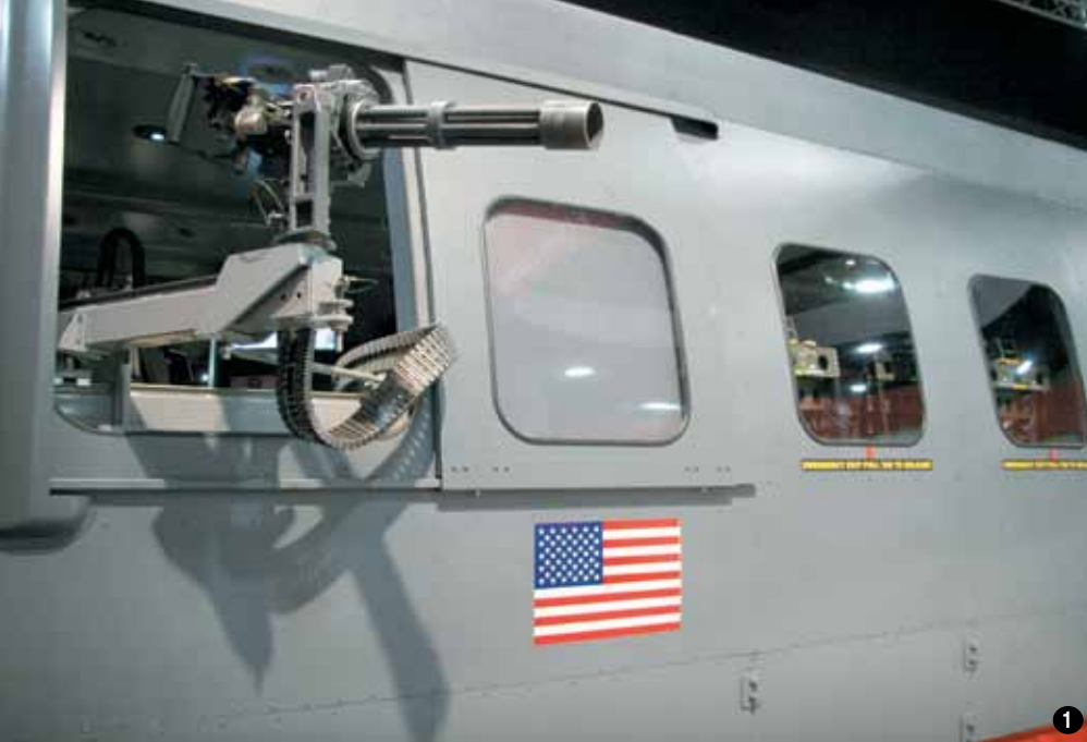
111 AgustaWestland's AW-101 offering for a new Air Force support helicopter was available as a walk-through mockup, bristling with weapons. 121 AAI's display featured two full-scale remotely piloted aircraft overhead: the Shadow M2 and, below it, the smaller, modular Model 229.