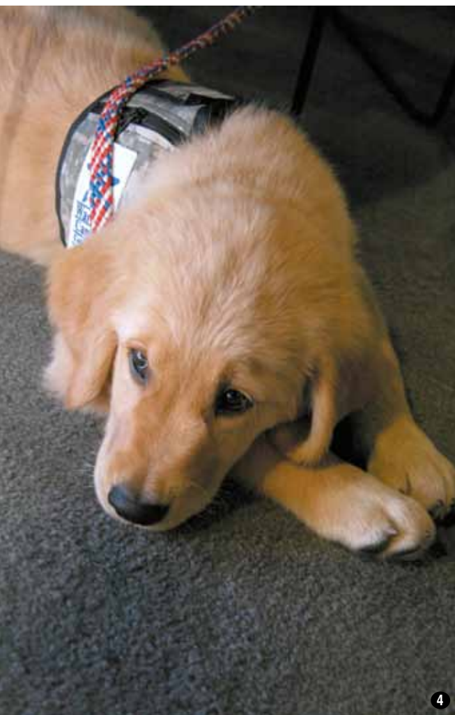
141 Dogs of the Warrior Canine Connection earned smiles and pats as they were walked around the expo. Troops who have post-traumatic stress disorder train the pups to become service dogs for mobility-impaired veterans.