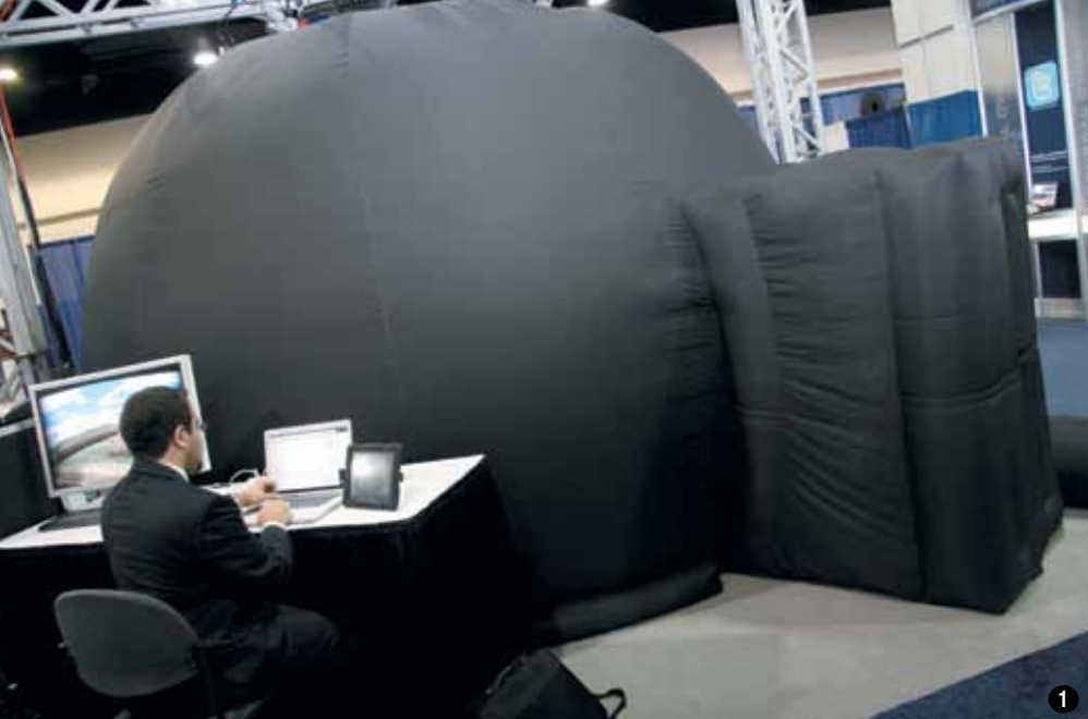
111 Not a black ice shelter, this igloo at the Cubic Defense Applications booth is a portable simulation dome called a Joint Fires Integrated Training Environment. It can link with other domes for a variety of training exercises. 121 A model of the A400M Grizzly, a developmental airlifter sized between a C-130J-30 and a C-17, wore Air Force colors at EADS' booth. 131 Duke Ku, an air attaché and F-16 pilot from the Republic of Taiwan, gets a briefing from Emanuele Cassan on Alenia Aermacchi's T-100 training system.