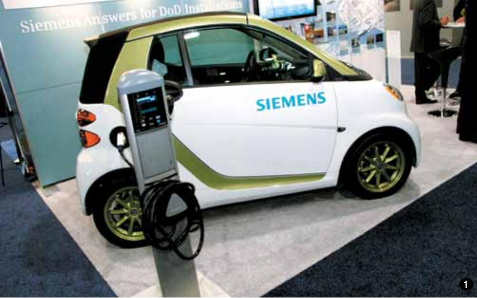
111 Siemens, mindful that USAF is increasingly energy cost-conscious, showcased an all-electric, plug-in car at its booth. 121 An upgraded-F-15 model, with an impressive load of air-to-air, air-to-ground, air-to-ship, and anti-radar munitions, and an AESA radar, graced Boeing's display. Behind is the KC-46 tanker systems trailer.